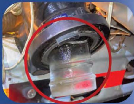
10" OF ICE IN PUMP VALVE RRFR, JAN. 2024

Volunteers must combat adverse weather conditions as they work from & store equipment in open barns & sheds